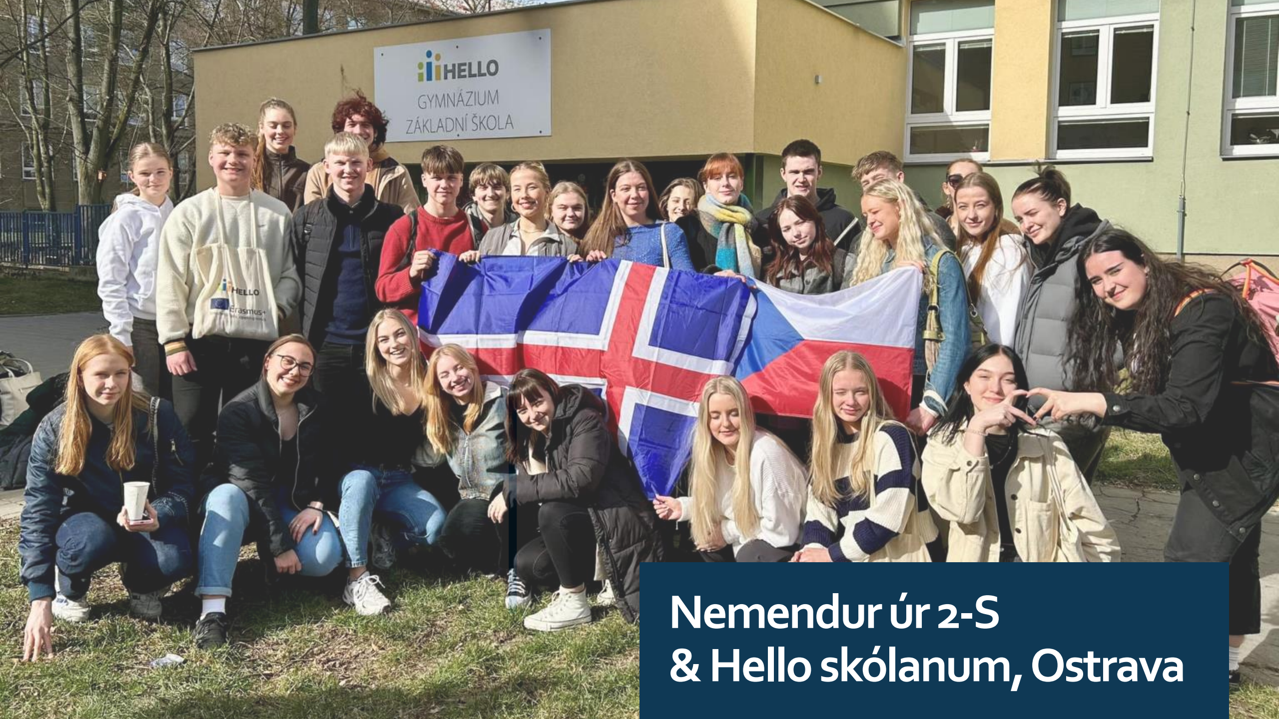
Nemendur úr 2-S & Hello skólanum, Ostrava